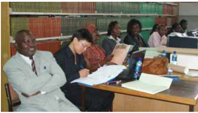
A KLISC-run Monitoring and Evaluating Electronic Resource Use (MEERU) workshop. A future facilitator of MEERU Vietnam was also invited to attend.

Despite the achievements of the Kenyan consortium, the road to its success was not always a smooth one. Founding members had to overcome a host of problems, many of which will be familiar to other researchers and librarians interested in setting up consortia.