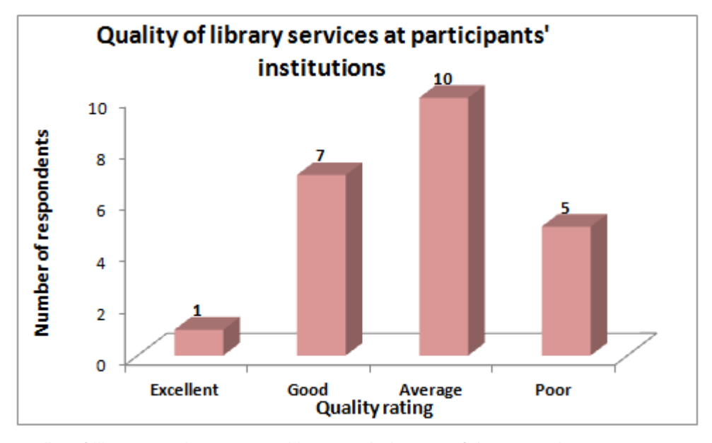
Figure 2: quality of library services as rated by sampled users of those services.

Online survey respondents were asked how they would rate the quality of information services provided in their institution's library based on how often they are assisted with finding resources they require. The results are presented in Figure 2, which shows that only a small percentage think highly of their library information services.