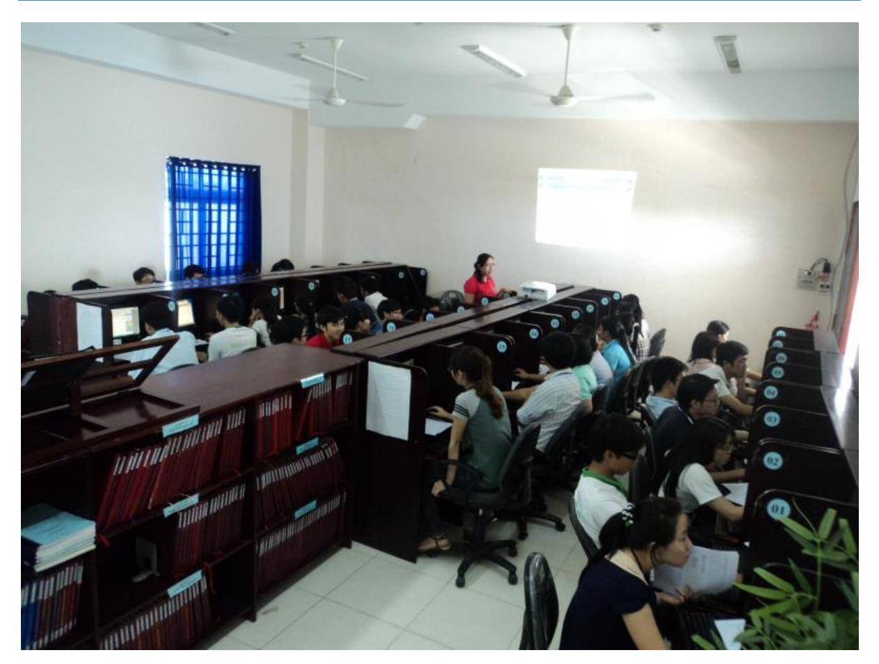
Online health information training course for students at Can Tho University of Medicine & Pharmacy on 9 March 2014.