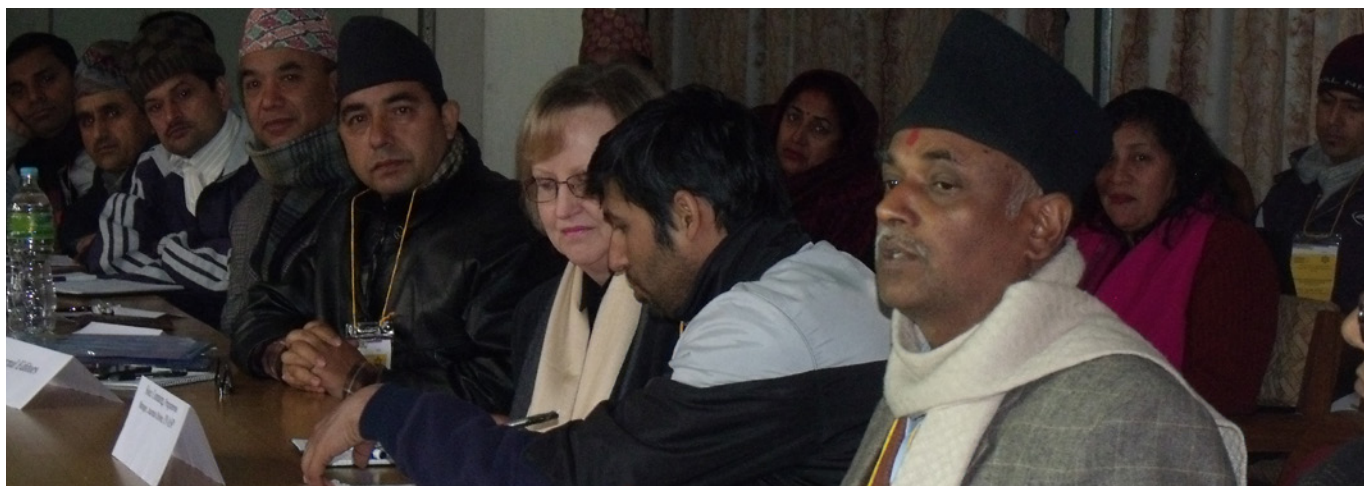
Journal editors and journalists made connections and shared information during a Media Interaction Session during a Nepal Journals Online workshop in Kathmandu in January 2016

change had a specific focus on “examples of science contributing to mitigation and/or adaptation in tandem with development challenges in Malawi, Nigeria or Sierra Leone”). This tight remit meant that it was relevant for only a handful of researchers on the AuthorAID network. In addition, many in the AuthorAID network are early-career researchers so have not published much and may not feel in a position to be interviewed as ‘experts’ on a topic.