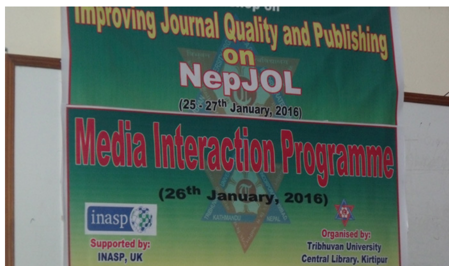
A Media Interaction Session formed part of the Nepal Journals Online workshop that was held in Kathmandu in January 2016

Recognizing the communication approaches of major, well-