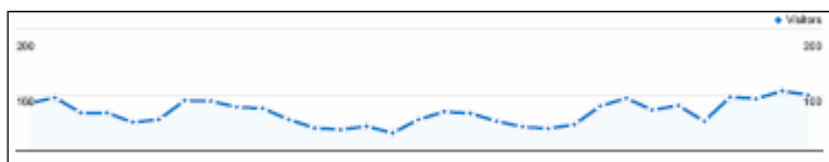
Visitors to BanglaJOL between Dec 11 2007 and Jan 10 2008

Visitors to BanglaJOL came from 97 countries: the top three sources for visitors were: India (629), USA (253) and Bangladesh (196). The number of visits is greater than the number of visitors because some visit more than once.